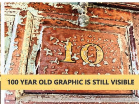
100 YEAR OLD GRAPHIC IS STILL VISIBLE