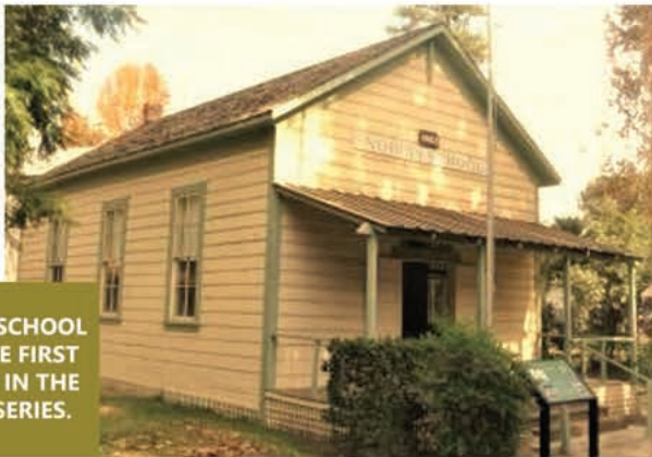
NORRIS SCHOOL WAS THE FIRST EXHIBIT IN THE VIDEO SERIES.