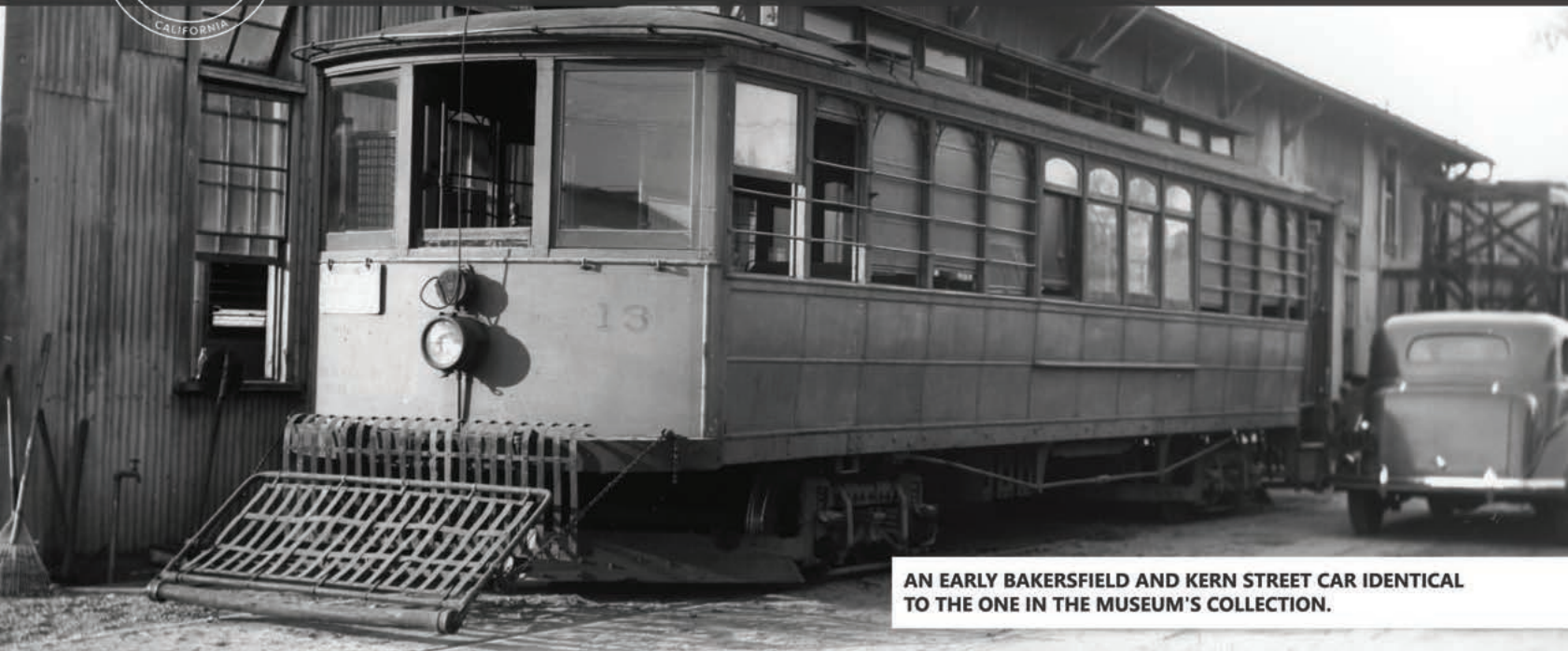
AN EARLY BAKERSFIELD AND KERN STREET CAR IDENTICAL TO THE ONE IN THE MUSEUM'S COLLECTION.

The Kern County Museum acquired a vintage Bakersfield streetcar back in 1980 after it had sat in a residential back yard for 50 years. Much of the interior had been gutted, seats removed and several bad attempts had been made to paint the interior. It was basically a shell of the shiny new trolley car that had first come to Bakersfield in 1912. The Museum put the car into storage and out of public view.