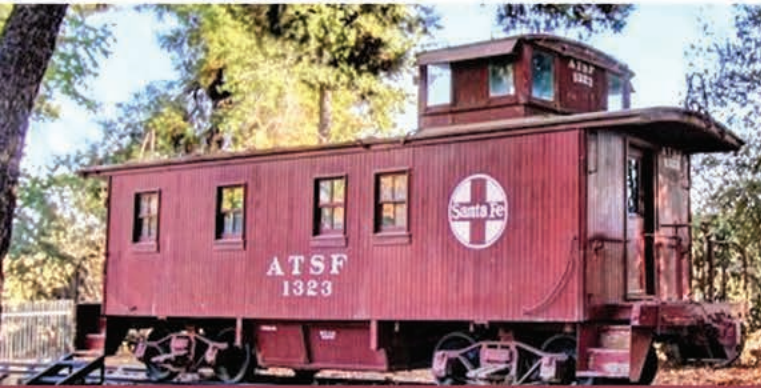
THE CABOOSE WAS FEATURED IN A RECENT VIDEO INCLUDING THE INTERIOR.